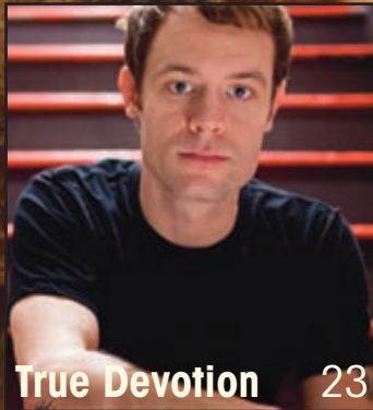
True Devotion 23