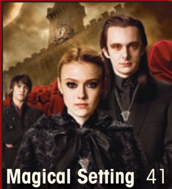
Magical Setting 41