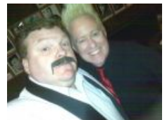
Comics take part in cable taping stars Burt Reynolds