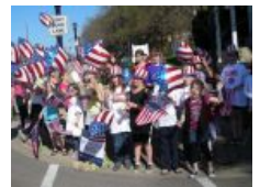
Top 10 photos of the week for May 1 to May 6