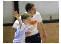
College coaches host Speed practice