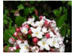
Blooming 2nd week of May