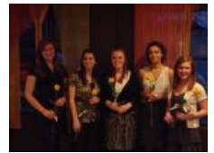
Zonta Club provides scholarships to local young women